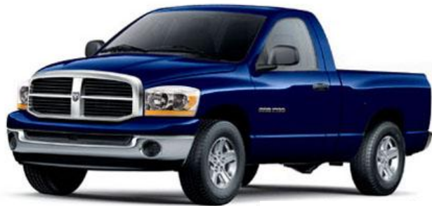
Dodge Ram MSRP: $25,525